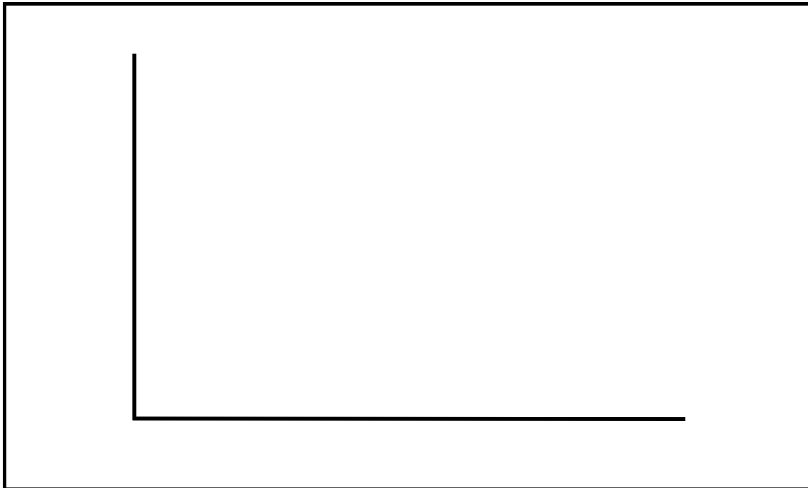
Maxwell Speed Distribution

Question 3: Experiment with the Maxwell Distribution Simulator ( under the “Speed Distribution” review section ). Then a) draw a sketch of a typical gas curve below, b) label both the x-axis and y-axis appropriately, c) draw in the estimated locations of the most probable velocity v_{mp} and average velocity v_{avg} , and d) shade in the region corresponding to the fastest moving 3% of the gas particles.